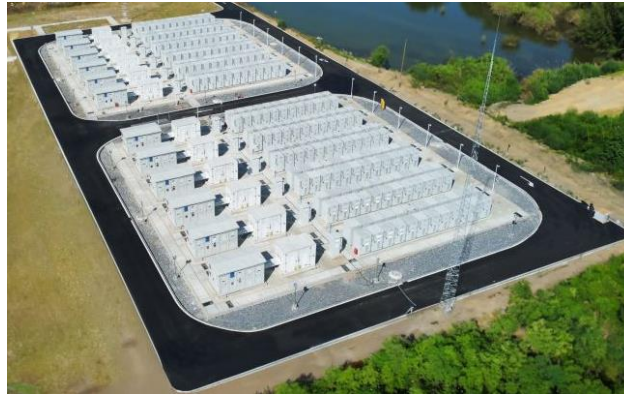
Figure 1 Multiple PowerIsland #3

The Power Island is a replicable element of a Battery Energy Storage System with the following features: