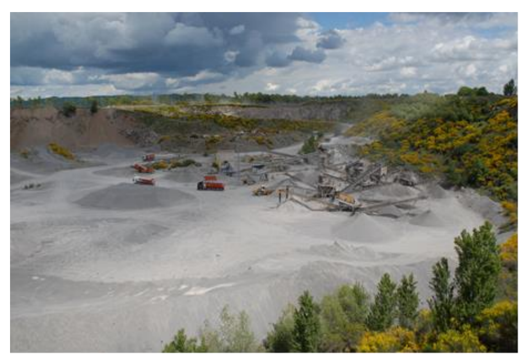
Fig.1 Basalti Orvieto quarry