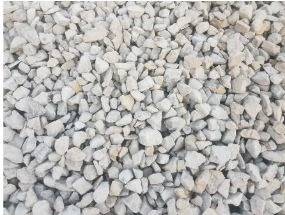
Fig.2 Ballast 31.5/50

Product identification and description: The product is constituted by stone aggregates obtained by mechanical grinding of basalt rock and subsequent sifting to obtain the 31.5/50mm size (Fig.2).