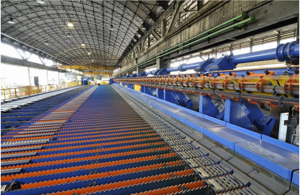
Sheet ingot casting