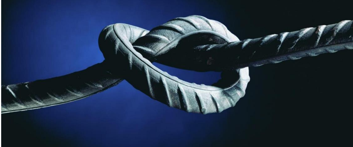
Knot with cold-drawn steel deformed bars for concrete reinforcement, diameter Ø 28 mm