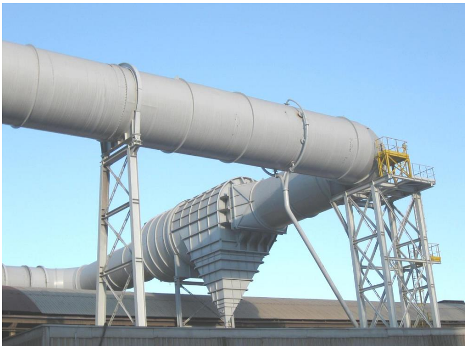
Fume suction and filtering system realized in 2010