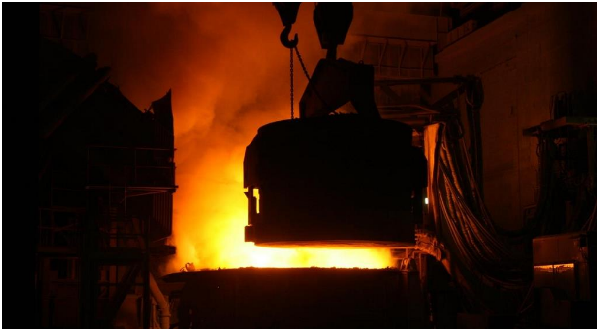
Steel scrap loading into the smelting furnace

This is exactly the purpose of our work. This is exactly why we have invested in ever new plants and in the most advanced technologies able to provide total control over each and every production parameter.