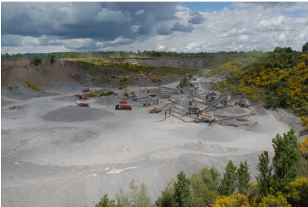
Fig.1 Basalti Orvieto quarry

Name and location of production site: Castel Viscardo quarry (TR)