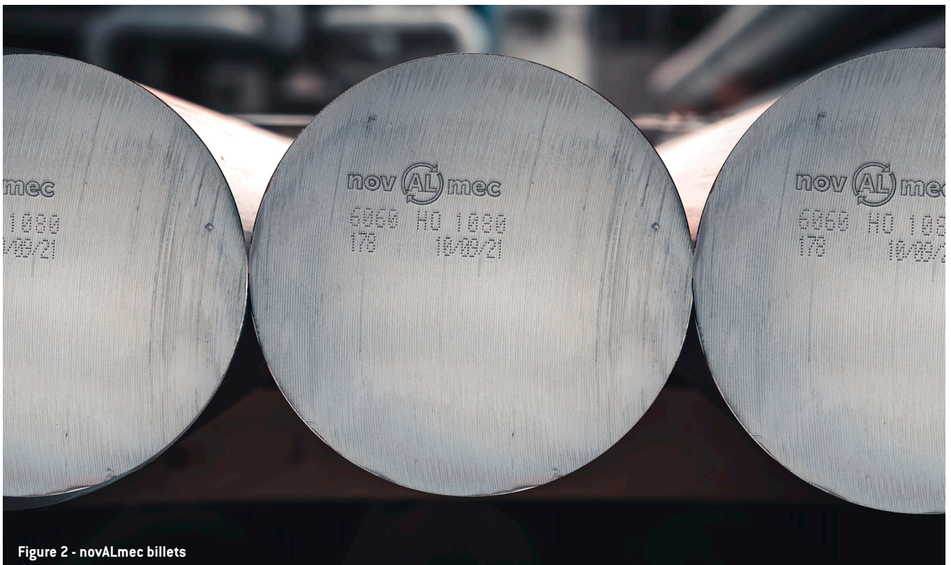
Figure 2 - novALmec billets

In the novALmec plant, in addition to the casthouse, there is a shredding and sorting plant with X-ray technology, which receives the incoming aluminum scrap derived from the collection of post-consumer scrap.