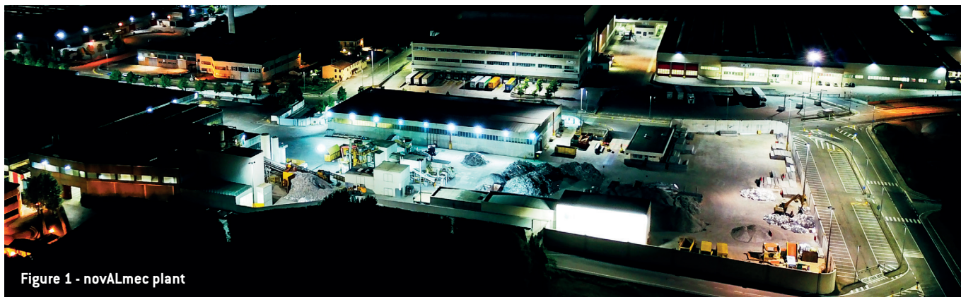
Figure 1 - novALmec plant

novALmec is the result of the joint venture between Novellini Industries, a Novellini Group company, and Metal Exchange Corporation and is able to meet the demand for secondary aluminum billets for the European market.